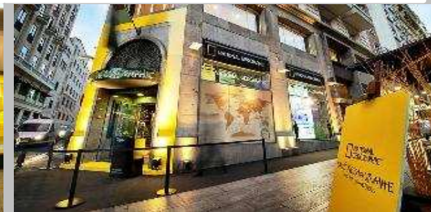
Brand development, product diversification and international expansion strategy