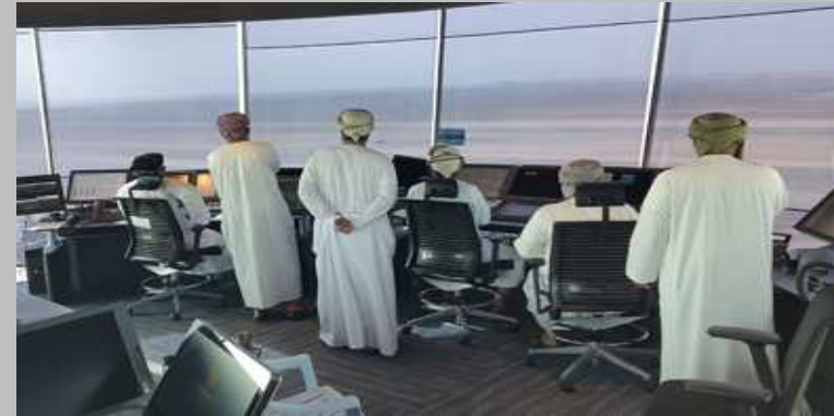
Air traffic management & Operations